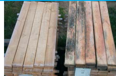
Trials of ANTIBLU™ SELECT treated timber against untreated timber after a 3 month period.

Sapstain, sometimes called blue stain, is caused by fungi which thrive on freshly cut logs and sawn timber causing unsightly discolouration. Infected timber is unacceptable for many end uses representing a huge loss in value.